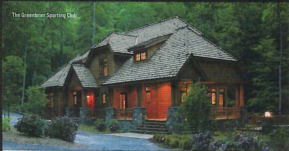
The Greenbrier Sporting Club