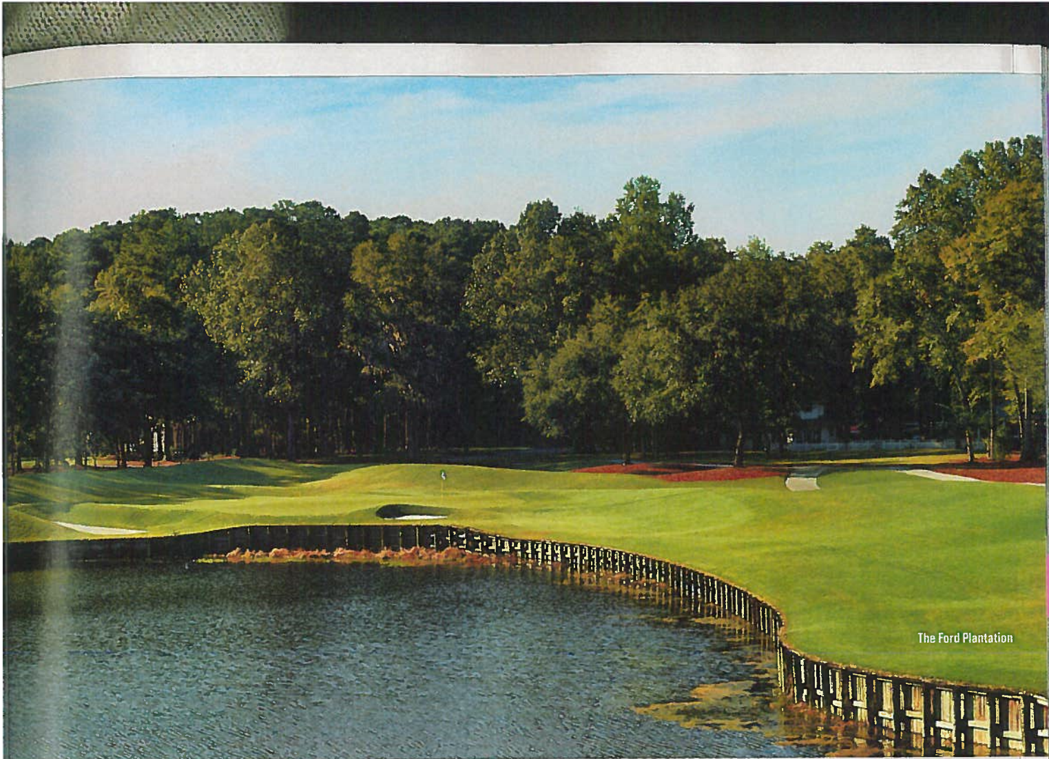
The Ford Plantation